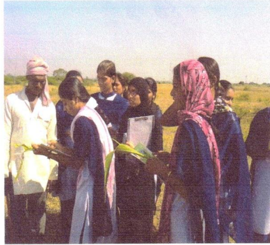
Interaction with farmers