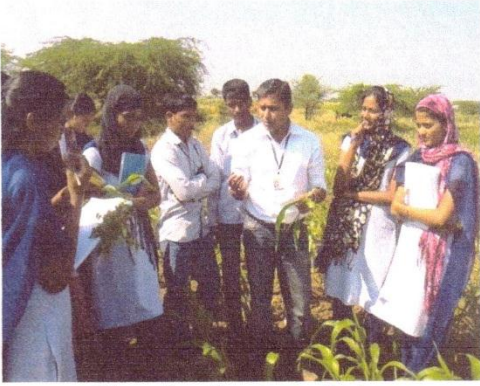
Observing disease on plants